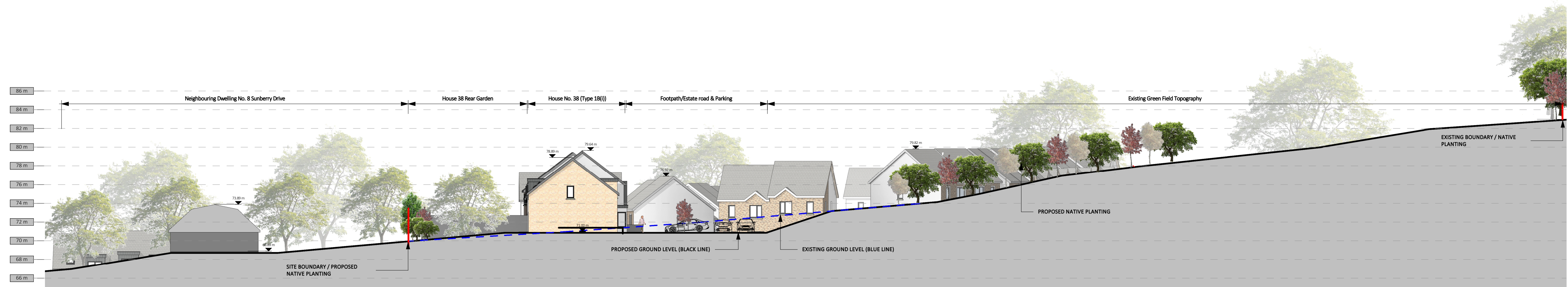
2 Site Section O 1 : 250